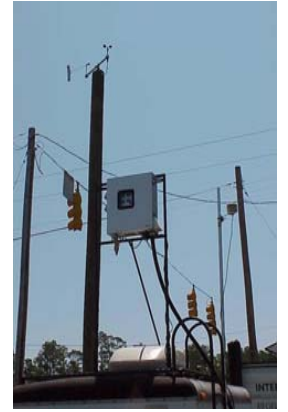
Mercury vapor analyzer and a mercury speciation unit