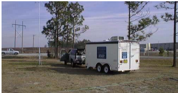
Emergency Air Monitoring Trailer

To accomplish and support these tasks, ATAST is equipped with two main response vehicles (an emergency air monitoring trailer and mobile air monitoring laboratory) and a main fixed laboratory, all of which house modern analytical instrumentation and other state of the art equipment.