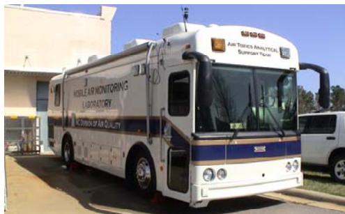
Mobile Air Monitoring Laboratory (MAML)