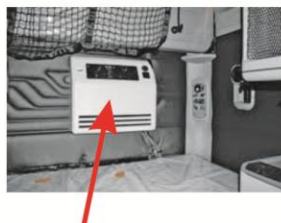
Thermal storage systems (TSS)