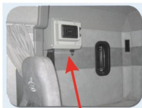
Fuel operated heater (FOH)

For Fuel Operated Heaters, Battery operated air conditioners, and thermal storage systems, also include a photo of the installed unit.